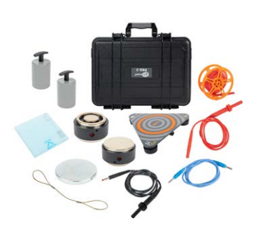
Kit for measuring resistance in zones with ESD protection